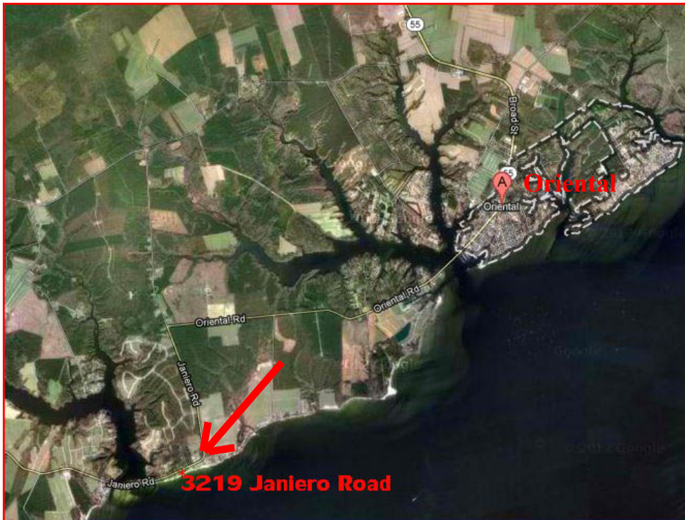
Location on the Neuse River near Oriental NC