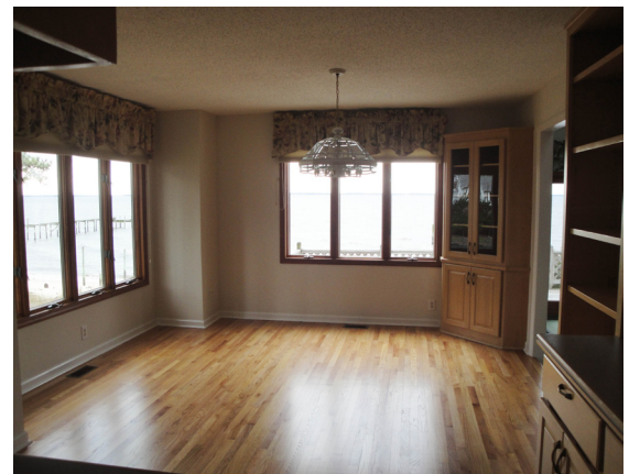
Family Dining Room