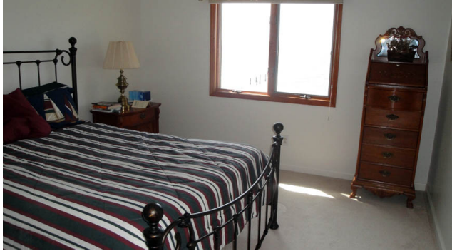
Bed Room 2