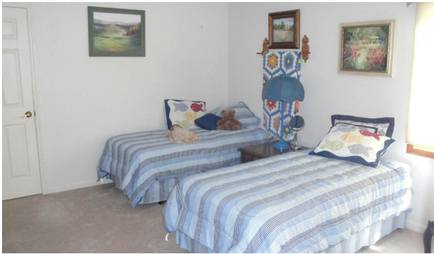
Bed Room 3